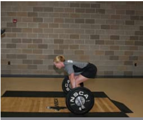
Figure 1. Power clean starting position