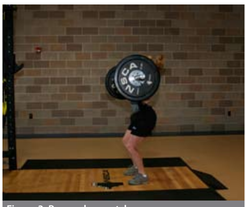
Figure 3. Power clean catch