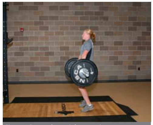
Figure 2.Power clean triple extension