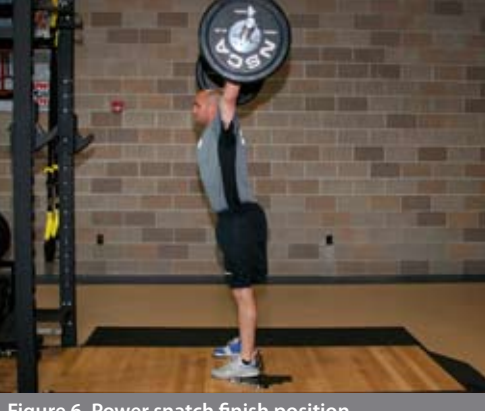
Figure 6. Power snatch finish position

to this success. Use of weightlifting movements is an important bridge to this. By using weightlifting movements such as the power clean and power snatch, you can begin to unlock explosive power that can help propel you to increased athletic success.